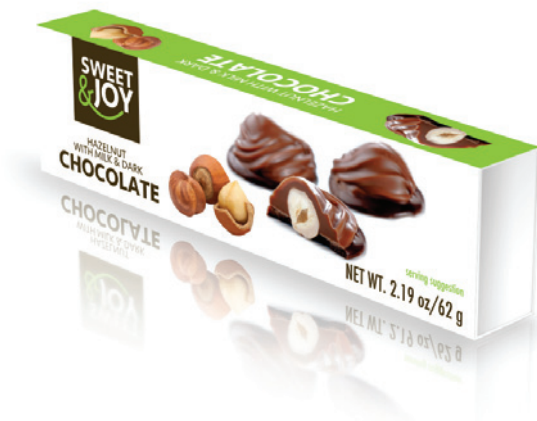
1016 Hazelnut with Milk & Dark Chocolate