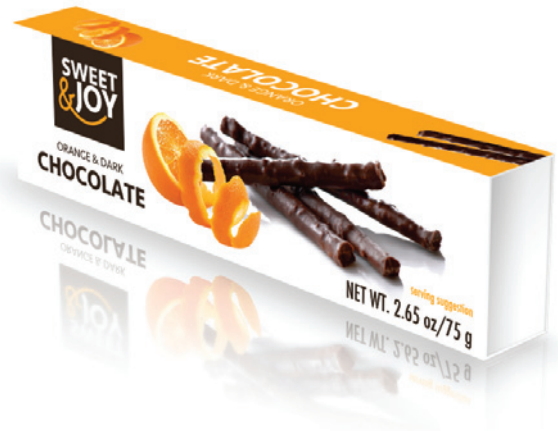
1014 Orange & Dark Chocolate