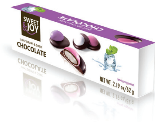
1017 Mint Drops & Dark Chocolate