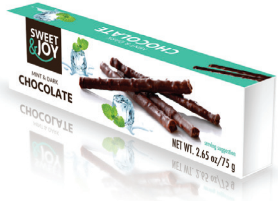
1013 Mint & Dark Chocolate