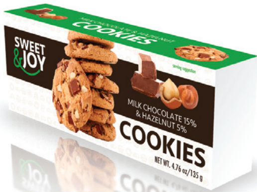
1001 Cookies with Milk Chocolate 15% and Hazelnut 5%