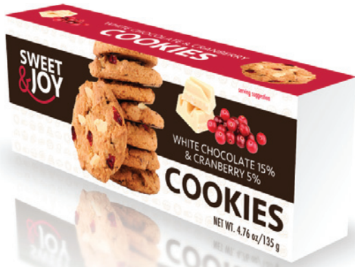
1003 Cookies with White Chocolate 15% and Cranberries 5%