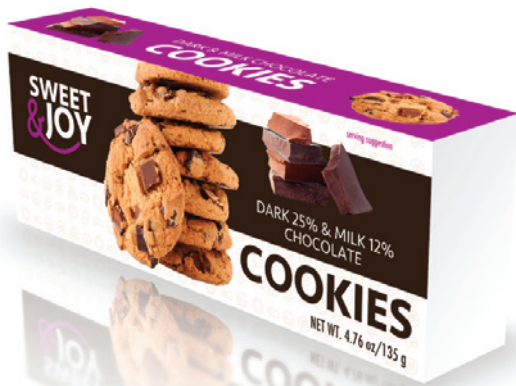
1002 Cookies with Dark Chocolate 25% and Milk Chocolate 12%