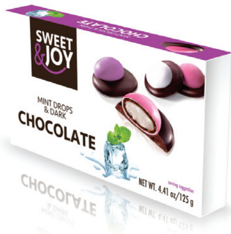
1011 Mint Drops & Dark Chocolate