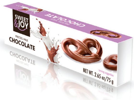
1015 Pretzel Milk Chocolate