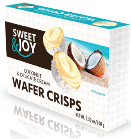
1008 Coconut & Delicate Cream Wafer Crisps