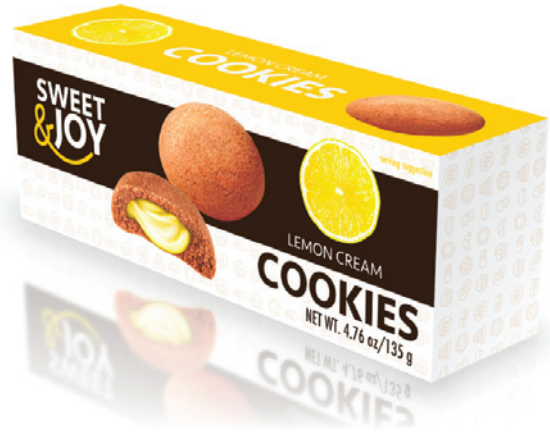
1006 Cookies with Lemon Cream 30%