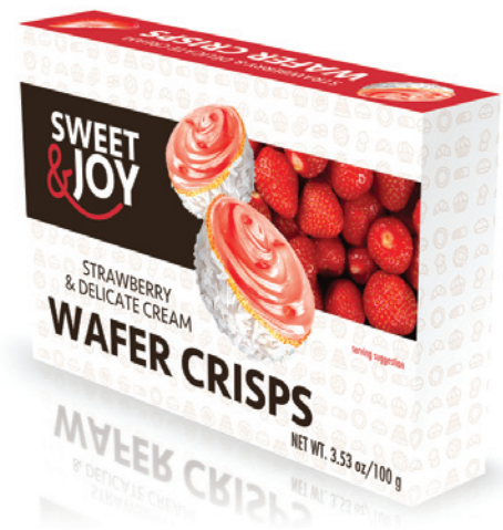
1009 Strawberry & Delicate Cream Wafer Crisps