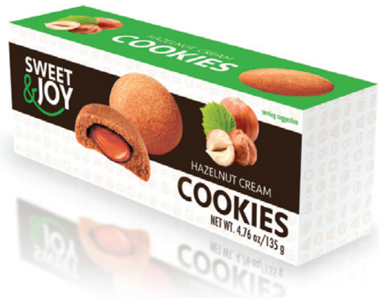
1004 Cookies with Hazelnut Cream 30%