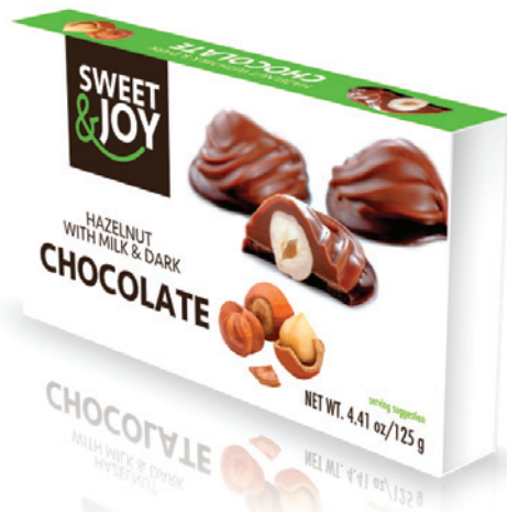
1010 Hazelnut with Milk & Dark Chocolate