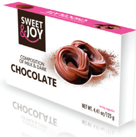
1012 Composition of Milk & Dark Chocolate