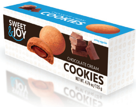
1005 Cookies with Chocolate Cream 30%