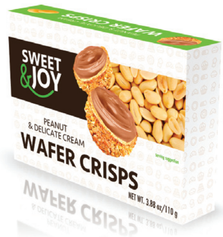
1007 Peanut & Delicate Cream Wafer Crisps